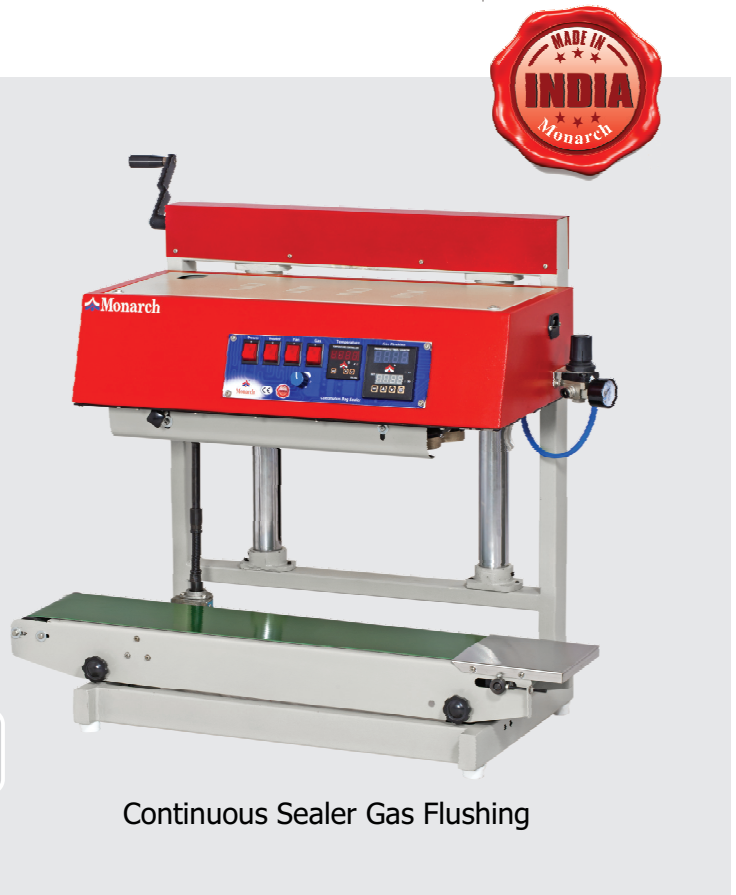
Continuous Sealer Gas Flushing

BOPP, Multilayer, Laminated, Polyesterpoly, Alu. foil, LD, PP, HD, HM and all type of sealable materials in every thickness.